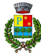
Comune di Pianello del Lario