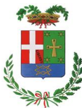
Provincia di Como