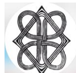
Pro Loco Gravedona